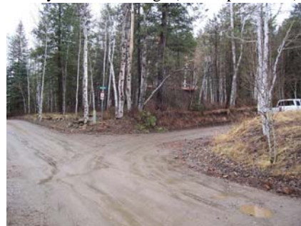
#5 Black Lode Trail (Right)