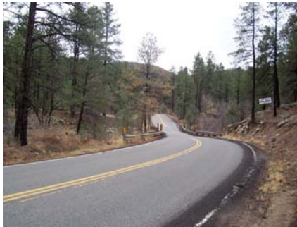
#1 One Lane Bridge