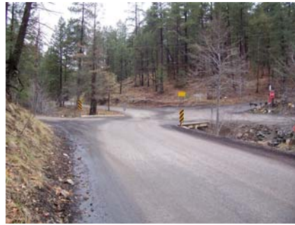
#2 Lynx Creek Bridge (end of pavement)