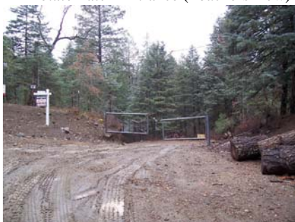
#7 Millsite Community Gated Entrance