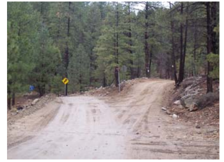
#3 Walker Road & Eagle Road "Y" (stay Left)