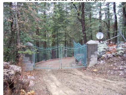
#8 Gated Entrance to MG Lodge