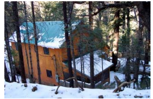
#6 MG Lodge as seen from Black Lode Trail