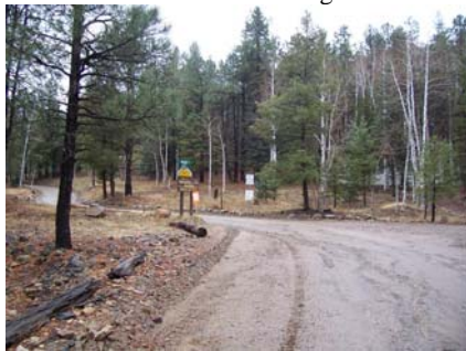
#4 Potato Patch Entrance (Poachers Row)